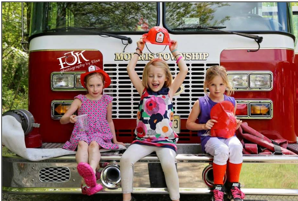
Above photo and additional Tunes for Thomas photos featured below were captured by EJK Photography by Elise.